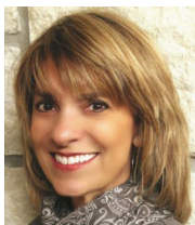
Your Seminar Leaders